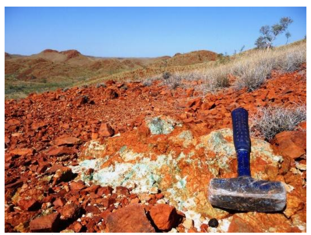
Figure 3. Copper (malachite) within altered basalt, gossan zone, Bridget prospect.

Bridget is yet another outstanding prospect within this remarkably mineralised tenement. Assay results from the Platypus sampling are expected in around a week's time.