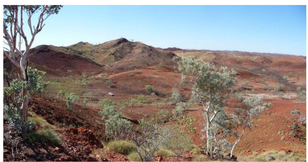
Figure 3. Panoramic view of Bridget prospect, looking west. Vehicle parked on stockwork zone drill target.

Platypus is excited by being the first company to drill the Bridget and Pearl Bar prospects, both of which were initially recognised in the 1970s yet have since remained forgotten and overlooked.