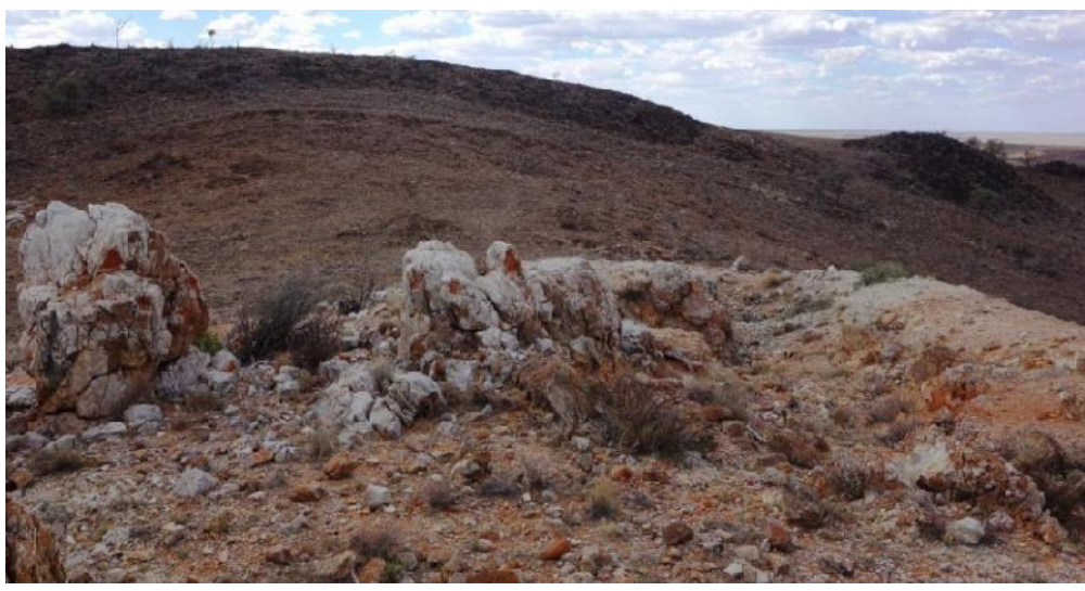
Figure 3. Outcropping amblygonite-bearing pegmatite at Euriowie.

Exploration activities will commence at Euriowie in the December 2016 quarter that will include surface mapping and geochemical sampling to target drilling.