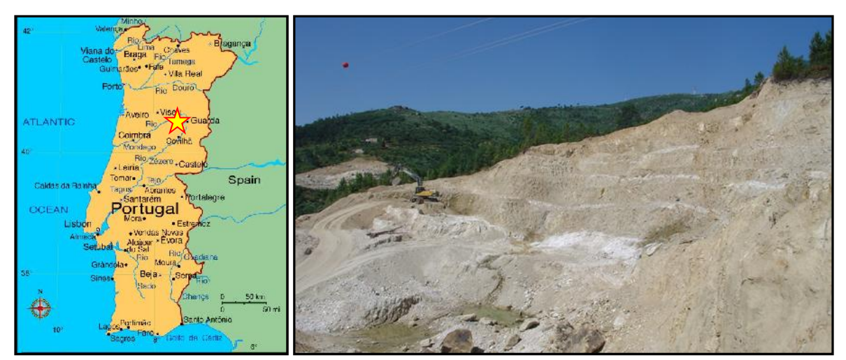
Figure 1. Alvarrões lepidolite mine, Block 3 pit, with Block 1 pit in the background. Guarda area, Portugal.

The Seixo Amarillo-Goncalo ("SAG") pegmatite field comprises numerous flat-lying pegmatites as sills within granite country rock. Larger individual pegmatites, ranging in thickness from 0.5 m to over 5m, can be traced for over 1 km along strike and at least 500 m across strike (Figure 2). Pegmatite density can range from 10% to 20% of the rock mass with thicker pegmatites displaying greater continuity and hence potential amenability to exploitation by underground bulk mining methods.